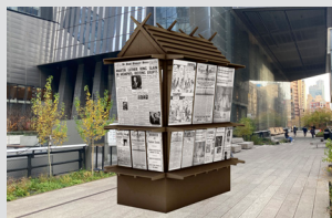
1. Faheem Majeed, Freedom's Stand (Sept 2022 – Aug 2023)