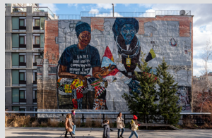
4. High Line Mural ( Rotating program ) Pictured: Jordan Casteel, The Baayfalls , 2017/2019